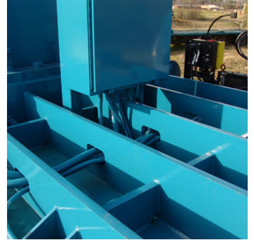
The Galaxy 2R narrow model features a heavy-duty reinforced honeycomb structure for maximum performance.