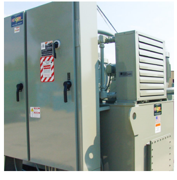
High-efficiency power units available from 50 HP up to 2x50 HP.