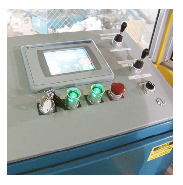
Color touch-screen operator interface PLC programmable controller features automatic and manual controls, diagnostics, and bale set-up functions. Available with multi-language function.