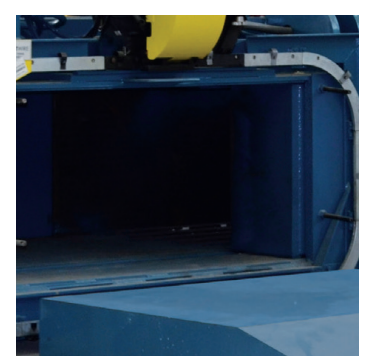
Multi-purpose door can serve as a bale separator, bale release, or bale clamp. It also allows for variable bale widths.