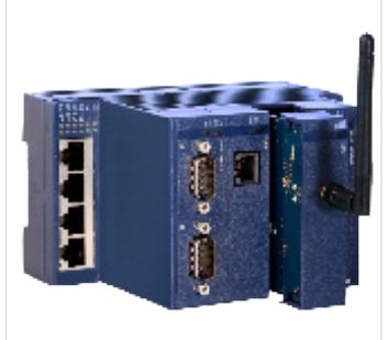
The Marathon® Galaxy Pro Monitoring System enables web-based, realtime monitoring of production and maintenance data. The Galaxy Pro will send email notifications to required personnel, and the Marathon Service Tech Team can also initiate contact. Can be used on Wide and Narrow Galaxy 2R models.