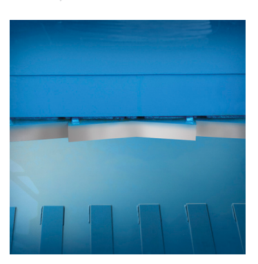
The Galaxy 2R narrow model ram shear blade is replaceable and reversible. The body shear blade is serrated, adjustable, and replaceable. Replaceable 500 Brinell steel liners on the floor, sides, and platens offer superior wear resistance.