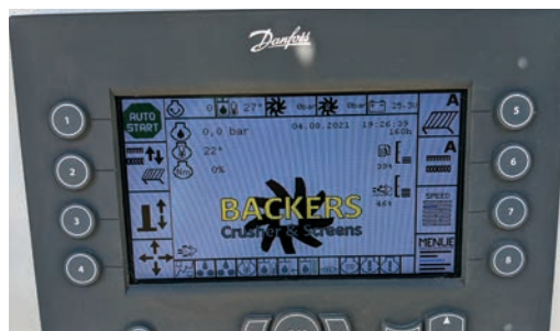
The precision control system allows the right product to be produced at the right level.