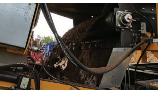
Hydraulic deck slider allows easy change from three-product to two-product configuration.