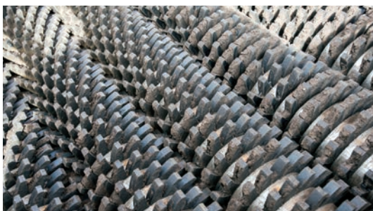
A four-bolt system connects the shaft and stars, creating stability and improving shaft tolerance.

Backers three-fraction star screens are highly maneuverable, and are available on stationary, wheeled, tracked, or our exclusive wheeled/tracked chassis. For ultimate flexibility and throughput, Backers three-fraction star screens are unmatched.