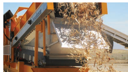
On three-fraction units, oversized material is only screened on the coarse deck to minimize wear.