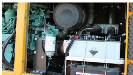
The rear-mounted engine compartment is fully accessible without the need for ladders or steps.