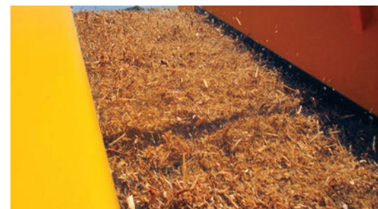
Heavy-duty stars agitate material to maximize production in wet conditions.