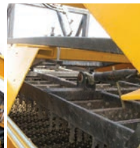
automatic deck cleaner