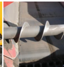
auger in hopper