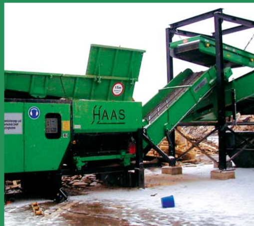
HDWV-E 700 x 2000