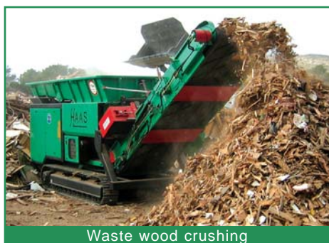
Waste wood crushing