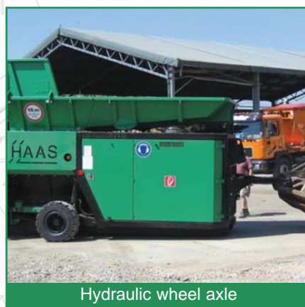
Hydraulic wheel axle