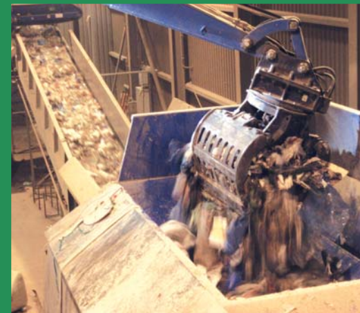
HDWV-E 900 x 2500