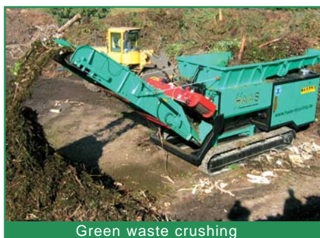
Green waste crushing