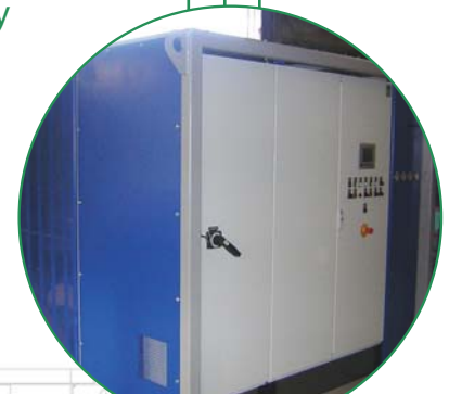
Separate hydraulic aggregate