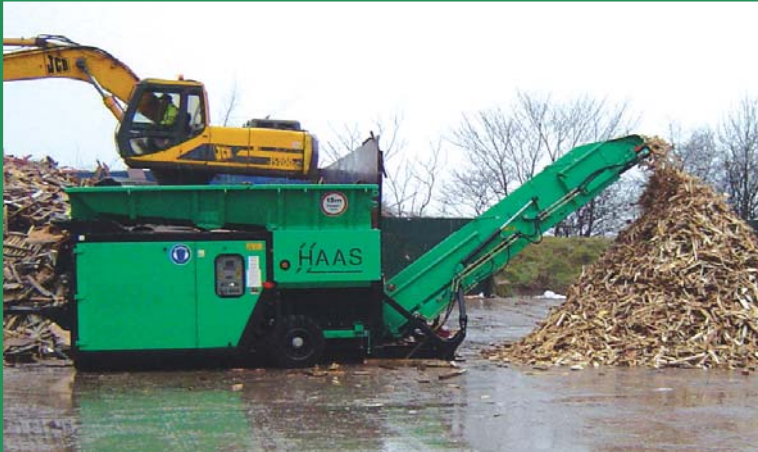
HDWV-D 700 x 1500