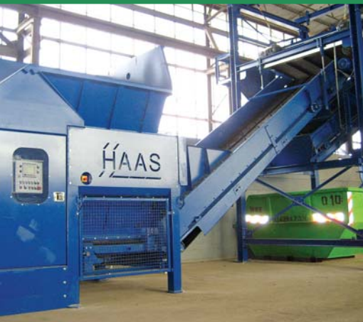
HDWV-E 700 x 1500