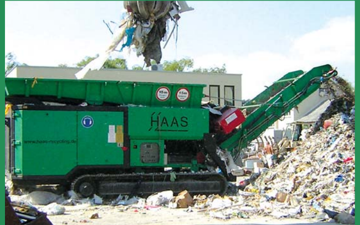
HDWV-D 700 x 2000